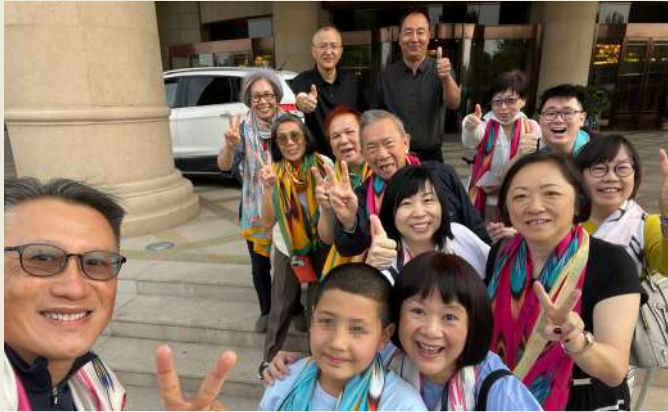
疫情後，與一眾善長探訪兒童。 After the pandemic, I visited the children with a group of philanthropists.

回首2023年，我們跨越了疫情的陰霾，也見證了希望與堅韌的力量。疫情結束後，中港通關，社會逐漸回歸正軌，而我們也終於有機會再次踏上青海這片熱土，與當地的領導和同事進行了深入的交流。更令我感到欣慰的是，在闊別三年之後，終於能夠再次探訪青海這些一直牽動我心弦的孩子們。