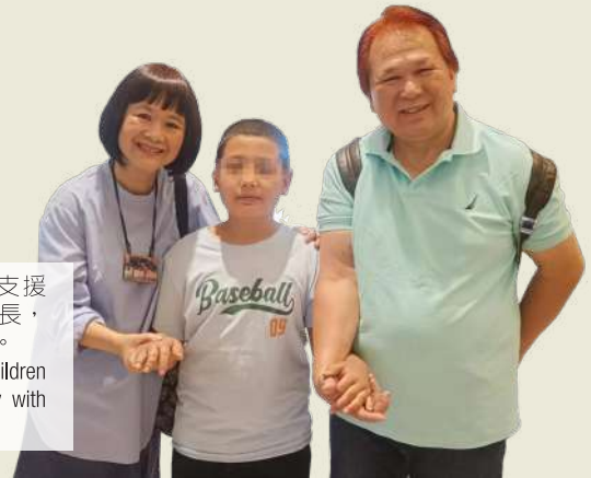
看到孩子得到我們的支援後，能夠健康快樂地成長，令我內心充滿愛與感動。 I feel so grateful to see children grow up healthy and happy with our help.

We have devoted countless efforts and lots of love into the newly-built Xining Children's Home. It is a partnership between Christian Action and the Qinghai Provincial Civil Affairs Bureau. Since its opening in 2020, it has become an important hub for us to serve orphans and children with disabilities in Qinghai. With its beautiful interior and cutting-edge amenities, the new home provides a family-like home for the children. I am deeply happy to see the children growing up well and learning new skills here. Without the kind donations and selfless commitment of so many kind people, none of this would be possible.